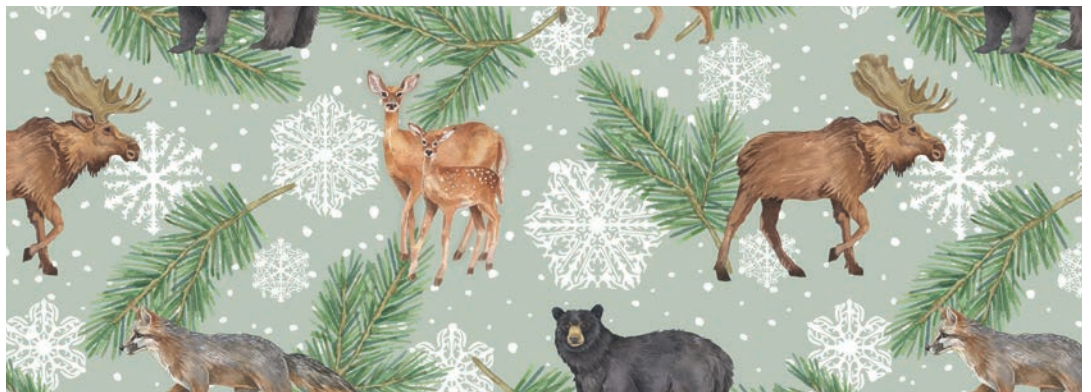
F24301-72 | Animal Coordinate | Sage Multi