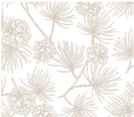
F24308-11 Pine Toile-Cream