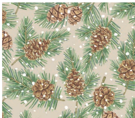
F24303-12 | Pinecones | Beige Multi