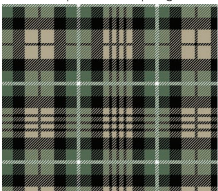
F24305-99 Dark Plaid-Black Multi