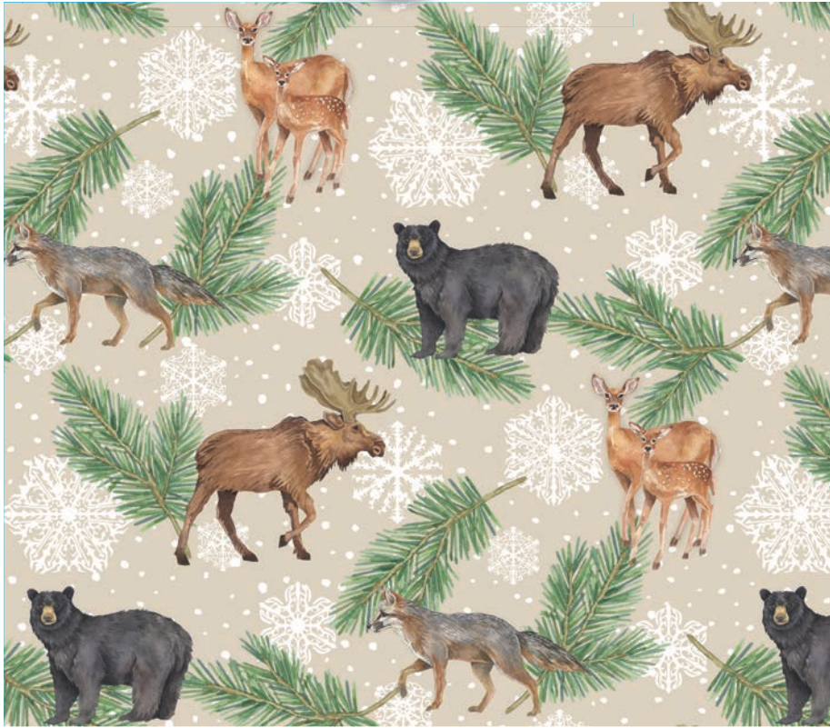
F24301-12 | Animal Coordinate | Beige Multi