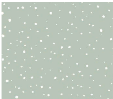
F24307-72 | Snowy Blender | Sage