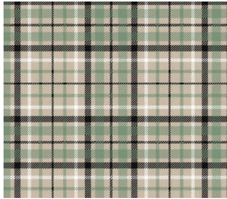
FF24304-12 | Light Plaid | Beige Multi