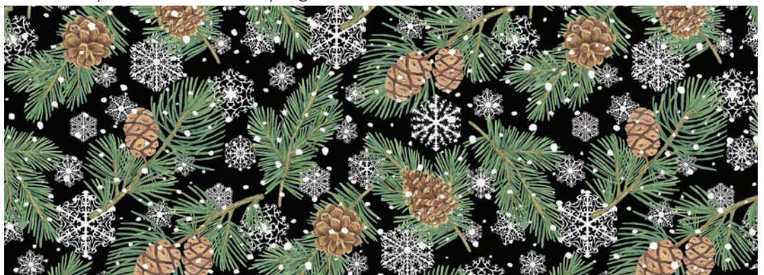
F24302-99 | Snowflakes and Pinecones | Black Multi

Created by Andrea Tachiera, Frosted Forest is printed on Northcott's premium quality flannel. The collection features bears, wolves, moose and deer with pine, pinecones and snowflakes as well as plaids. The collection is characterized by a palette of black, beige and sage giving this classic woodland theme an updated look. Snuggle up with Frosted Forest.