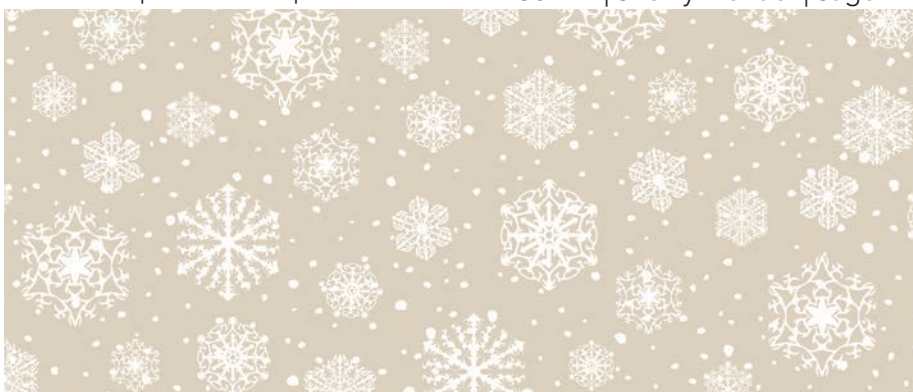
F24306-12 | Snowflakes | Beige