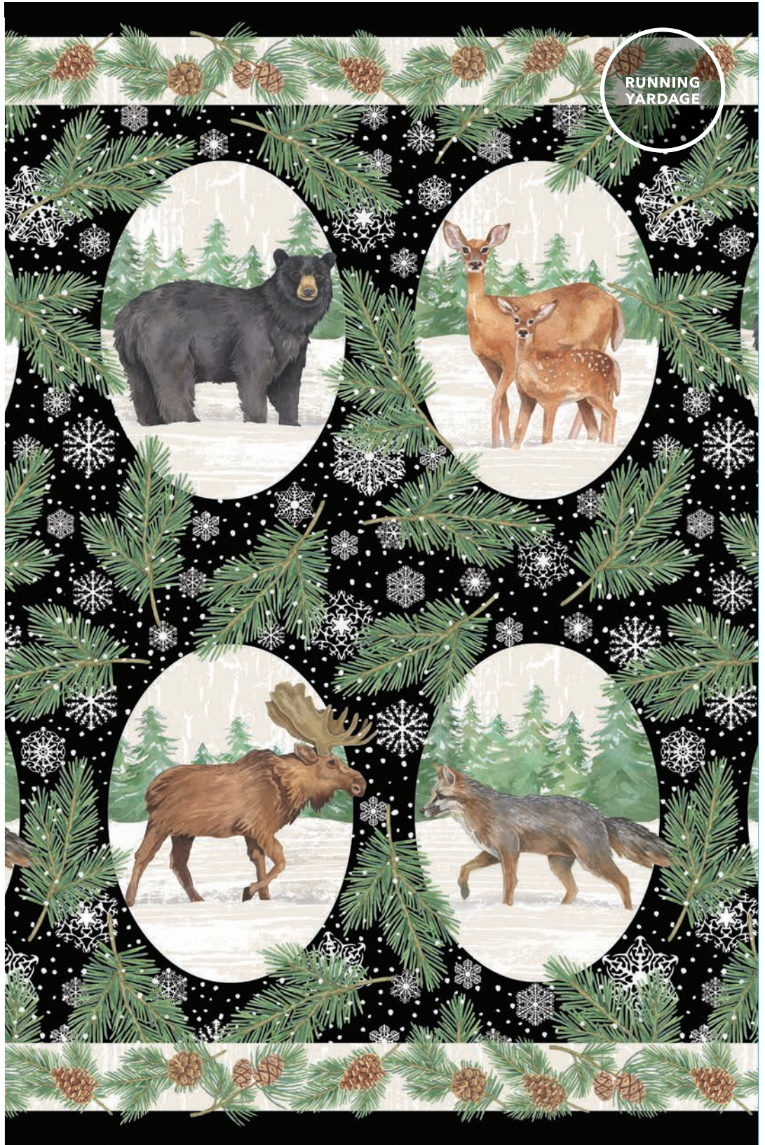
F24300-99 | Oval Animals(Running Yardage) | Black Multi